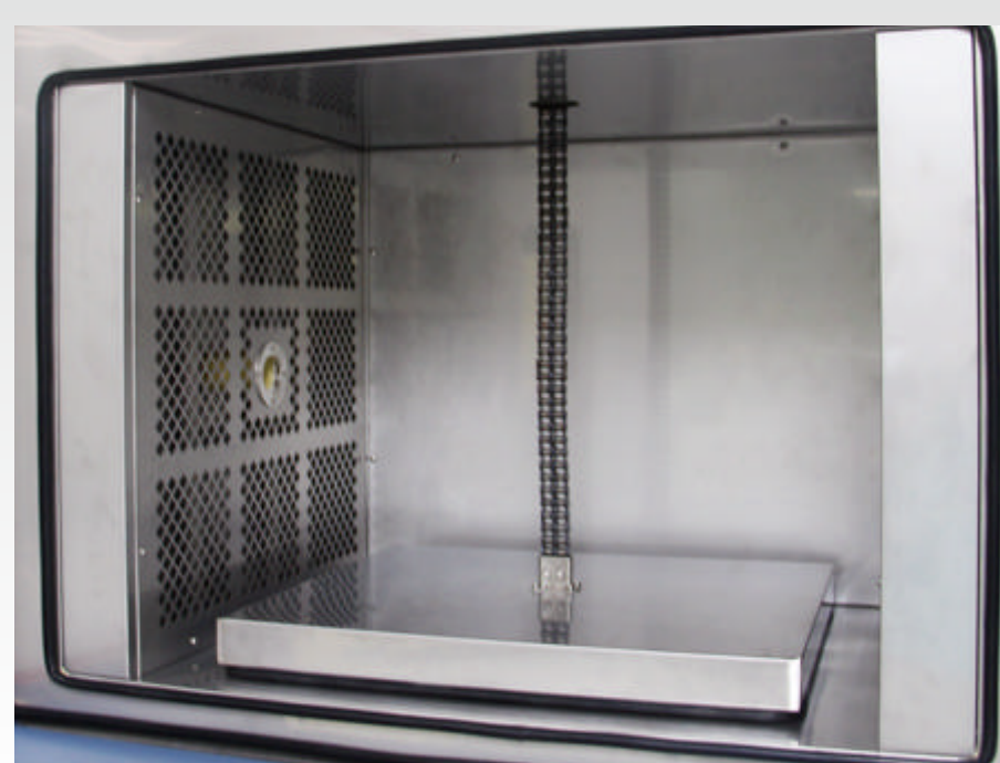
High Temperature Zone