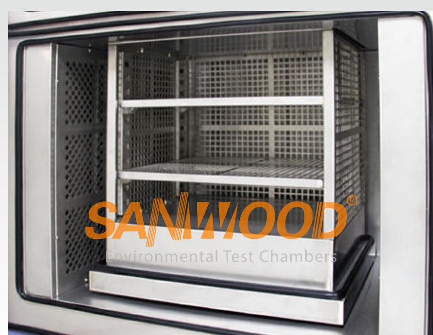
Low Temperature Zone